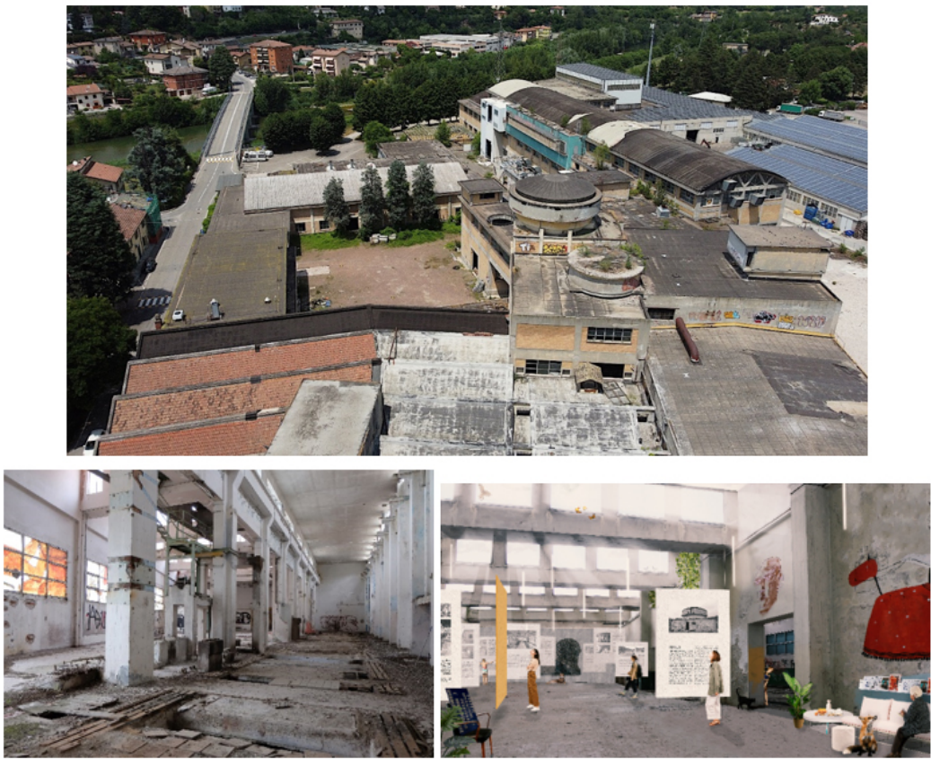
(Figs. 5 to 8) contd.....