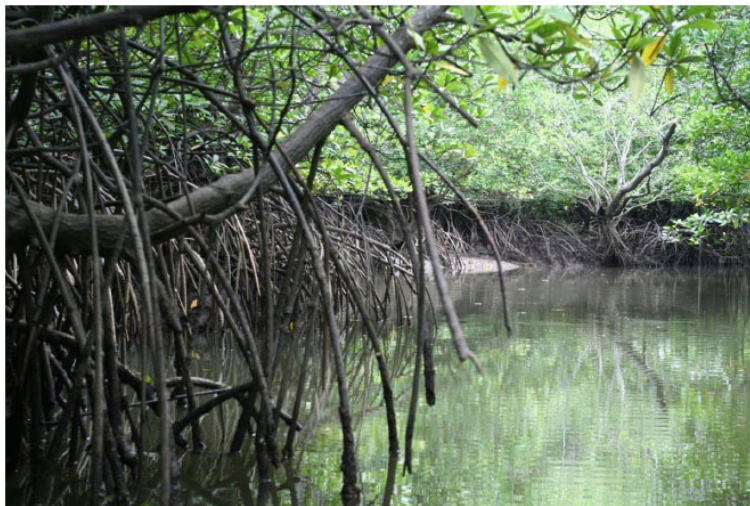
Fig. (1). Mangrove area in Malaysia image: Missgioia.com.

Although the number of species in the 80 taxa is not particularly large, mangrove taxa are found across a wide range of plant family lineages [15]. They mostly consist of a small but diversified group of shrub and tree species from 18 plant groups, total 69 species and 11 hybrid intermediates. There are 32 genera in total, with all but one of them being flowering plants. Mangrove species' distributional ranges are extremely diverse [16]. Others have distributional ranges that are more localized over the world. The Indo-Malesian (Fig. 1) area now serves as the primary diversity hotspot for mangroves, analogous to other shallow water, and tropical marine environments such as seagrass and coral species [17].